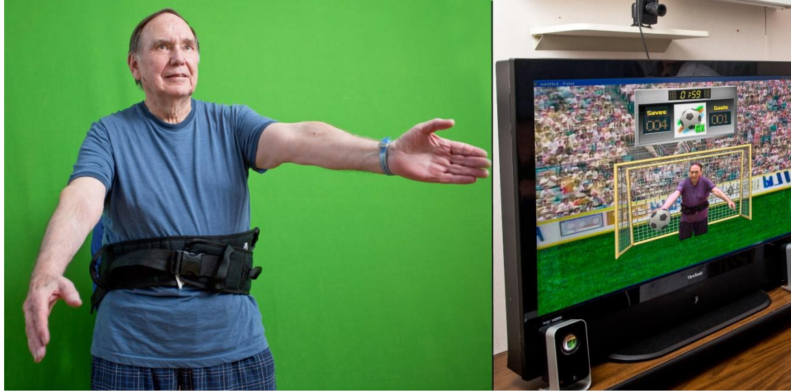
Figure II: VRRASS participant playing the soccer application. LEFT: Participants stood in front of a green screen with a physio belt around their waist while being monitored by a researcher (behind the participant). RIGHT: The participant sees himself immersed in a soccer net. Above the TV is the camera that captures the image of the participant. Photo used with permission of the participant.