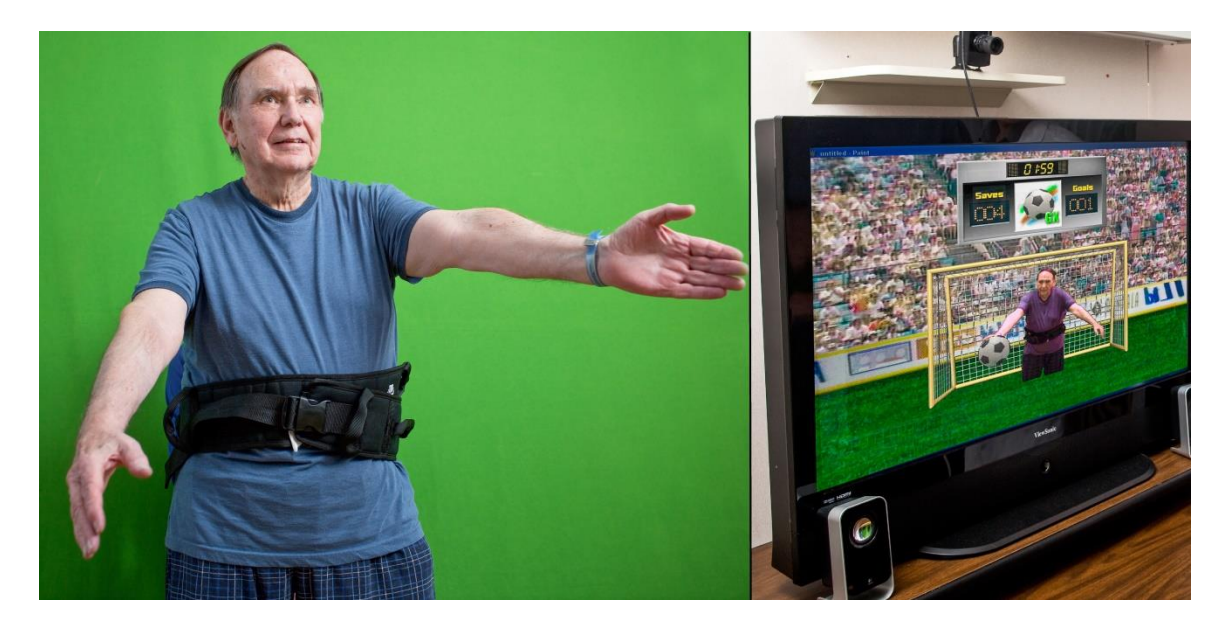
Figure II: VRRASS participant playing the soccer application. LEFT : Participants stood in front of a green screen with a physio belt around their waist while being monitored by a researcher (behind the participant). RIGHT : The participant sees himself immersed in a soccer net. Above the TV is the camera that captures the image of the participant. Photo used with permission of the participant.