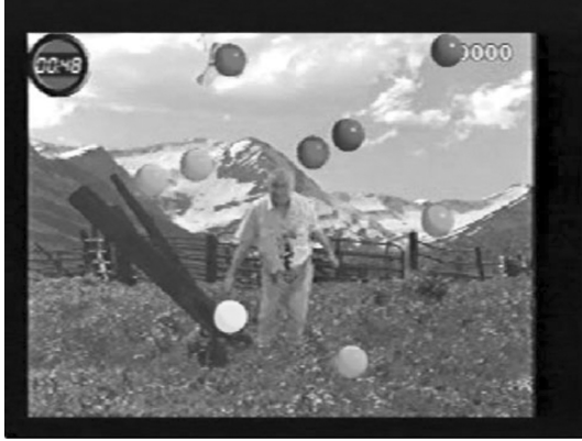
Figure 13.3 VividGroup's GX-VR system ( www.vividgroup.com ) video-capture projection VR system.