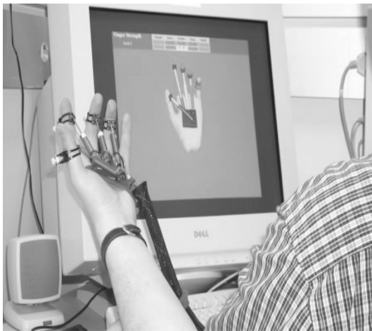
Figure 13.4 Rutgers Master II force-feedback glove.

The technologies mentioned above address only the output aspect of the VR experience. Equally important to achieving a realistic experience within a virtual environment is the ability of the user to navigate and manipulate objects within it. Thus the user must be able to interact (directly or indirectly) with the environment via a wide array of input technologies. One class of input technologies may be considered as direct methods since users behave in a natural way, and the system tracks their actions and