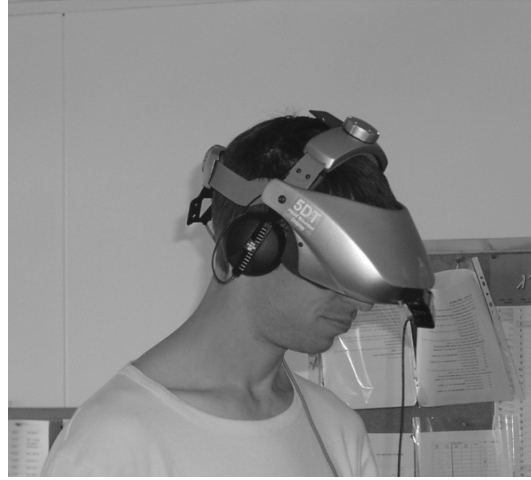
Figure 13.2 Fifth Dimension Technologies ( www.5dt.com ) HMD.

Sophisticated VR systems employ more than specialized visual displays. Engaging the user in the virtual environment may be enhanced via audio display, either ambient or directed to specific stimuli (Västfjäll, 2003). In recent years, haptic display has been introduced to the field of VR. Haptic feedback enables users to experience the sensation of touch, making the systems more immersive and closer to the real world experience. Haptic gloves, such as the Rutgers Master II shown in Fig. 13.4, may provide force feedback while manipulating virtual objects (Jack et al., 2001) or for strength training (Deutsch et al., 2002). Haptic information may also be conveyed by simpler means such as a force-feedback joystick (Reinkensmeyer et al., 2003) or a force-feedback steering wheel (Kline-Schoder, 2004). Other, less frequently used ways of making the virtual environment more life-like are by letting the user stand on a platform capable of perturbations and thereby providing vestibular stimuli such as that available with Motek's CAREN multisensory system ( http://www.e-motek.com/medical/index.htm ). Still more rare is the provision of olfactory feedback to add odor to a virtual environment, a feedback channel whose potential is now being investigated (Harel et al., 2003).